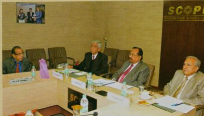
The Jury meeting of the SCOPE Excellence Awards 2011-12 in progress.

SCOPE Excellence Awards are considered as the most prestigious and outstanding recognition of the Public Sector Management. These awards have been conceptualized and instituted to recognize the contribution and achievements of Public Enterprises as well as to encourage and motivate outstanding persons for their hard work and leadership qualities. Award for recognizing the efforts in turning around loss making/sick unit and for the "Outstanding Woman Manager in PSEs" are also given.