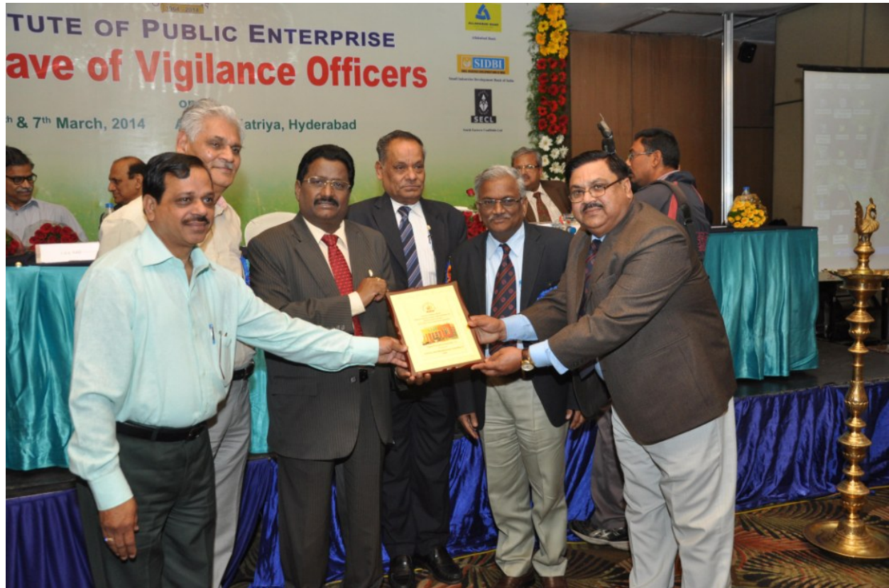
Received “Vigilance Excellence Award”(Category II – Special Award) for the Year 2013-14 given on the eve of IPE’s Golden Jubilee celebrations on 06.03.2014 at Hyderabad