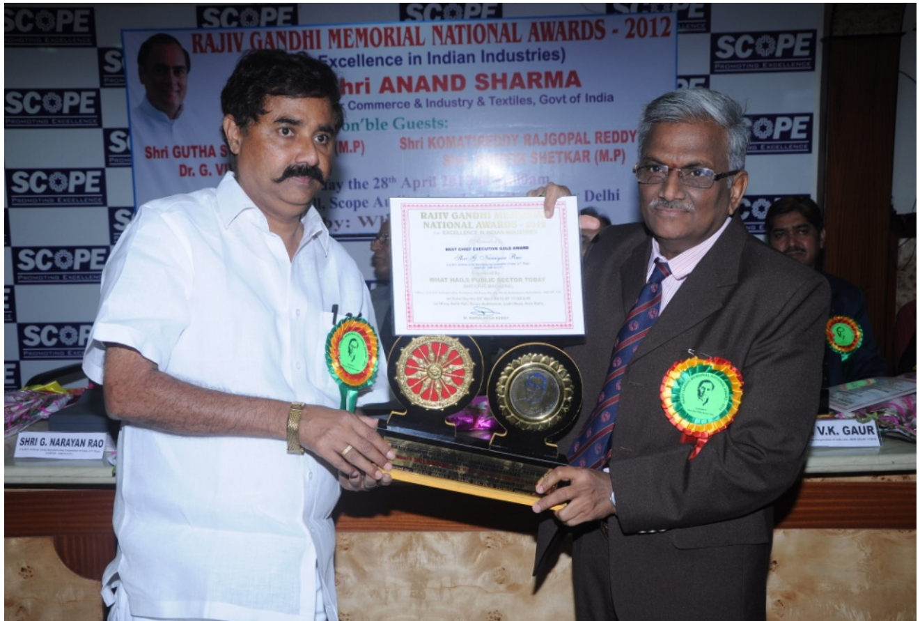
Honored with "BEST CHIEF EXECUTIVE GOLD" award under Rajiv Gandhi National Memorial Awards by the Public Sector Today, a National Monthly Magazine, at SCOPE Complex, New Delhi, on 28.4.2012