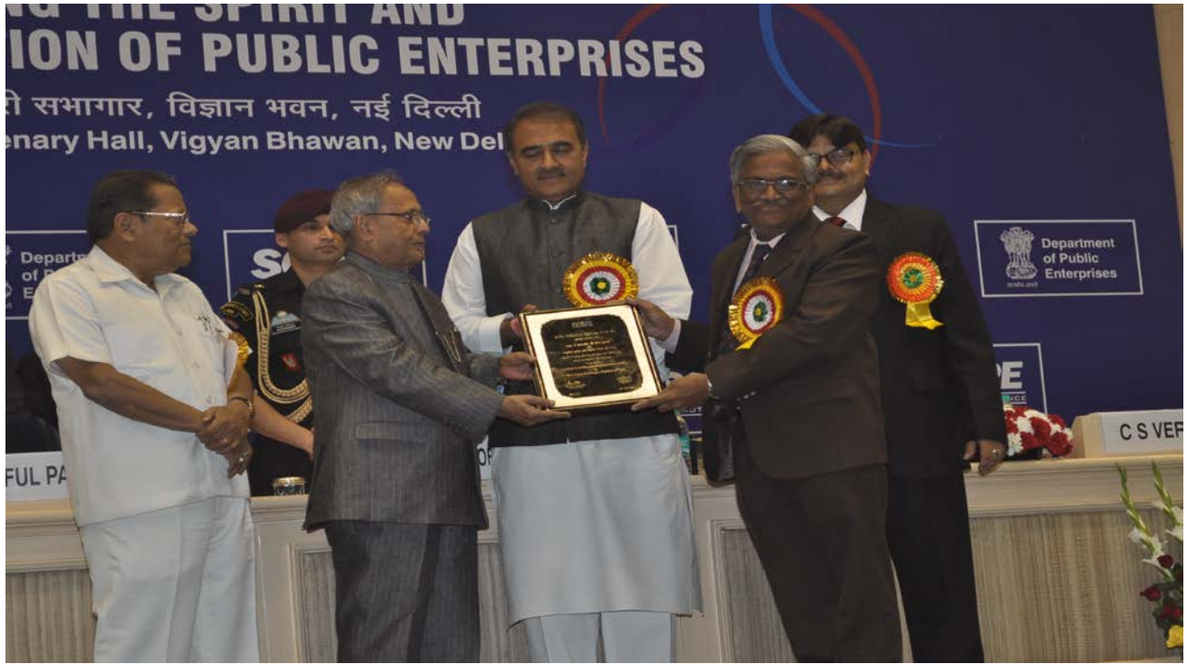
Recipient of SCOPE Commendation Certificate under Section 25 category PSE for the year 2011-12 on the occasion of 4th Public Sector day from Shri Pranab Mukherjee, Hon'ble President of India and Shri Proful Patel, Hon'ble Minister for Heavy Industries and Public Sector Enterprises, on Friday, 26th April 2013, Vigyan Bhawan, New-Delhi.